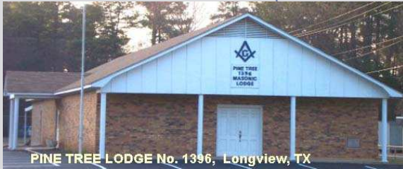
PINE TREE LODGE No. 1396, Longview, TX