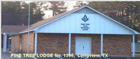
PINE TREE LODGE No. 1396, Longview, TX