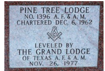
Cornerstone of the Lodge Building.