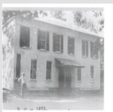
1852— Masonic Lodge and Pine Tree School

“Pine Tree Masonic Lodge will receive the Vanguard Award in 2010.”