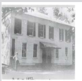
1852— Masonic Lodge and Pine Tree School